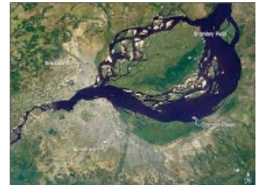
The Congo river

Entertainment Headlines Film Music TV This Week In... In Review