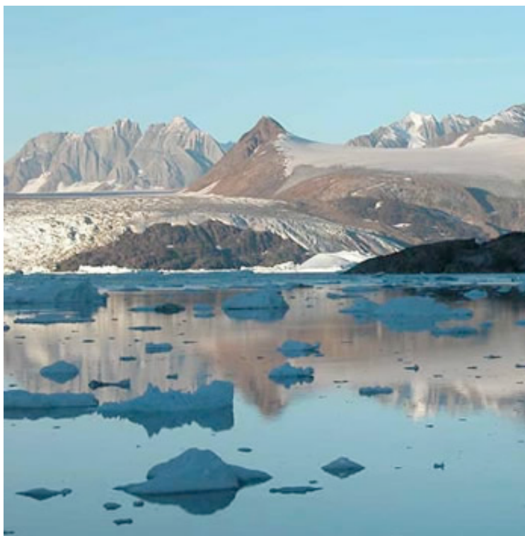
Greenland's ice cap is melting at a frighteningly fast rate. Chunks of ice regularly fall into the sea in Greenland, where ice is melting at a rate three times faster than it was only five years ago.

According to the scientists' data, Greenland's ice is melting at a rate three times faster than it was only five years ago. The estimate of the melting trend that has been observed for nearly a decade comes from a University of Texas team monitoring a satellite mission that measures changes in the Earth's gravity over the entire Greenland ice cap as the ice melts and the water flows down into the Arctic ocean.