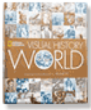
Visual History of the World Book