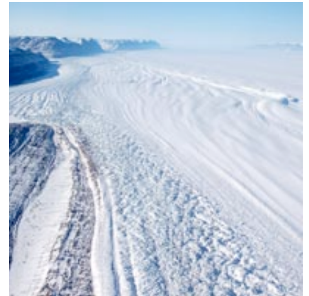
Image right: Petermann Floating Tongue in north Greenland. + Browse version of image

These new data come from the NASA/German Aerospace Center's Gravity Recovery and Climate Experiment (Grace). Launched in March 2002, the twin Grace satellites circle the globe using gravity to map changes in Earth's mass 500 kilometers (310 miles) below. They are providing a unique way to monitor and understand Earth's great ice sheets and glaciers.