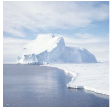
Antarctica. + Browse image

Measuring variations in Antarctica's ice sheet mass is