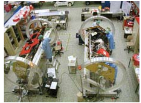
State of GRACE: workers in Plesetsk prepare the twin satellites for their launch later this month.