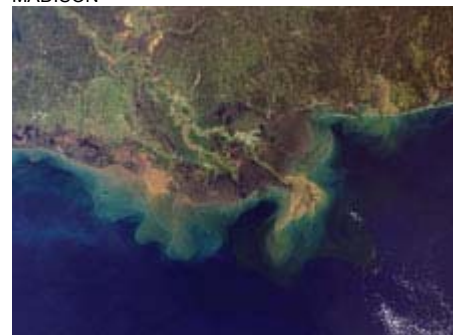
Water world: high-resolution GRACE data could allow floods in the Mississippi basin (above) or melting ice to be monitored.